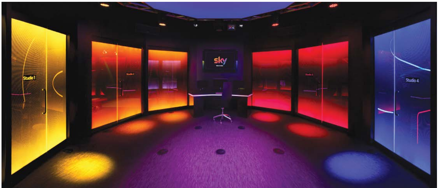
Dynamic edge-lit glass partitions and doors to the four Skills Studios at Sky TV's headquarters in London