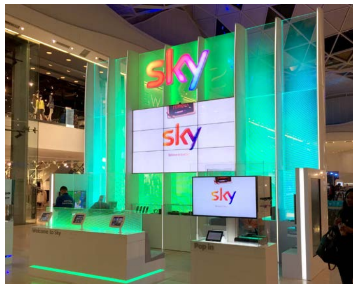
Sky's iconic light wall in London's Westfield White City